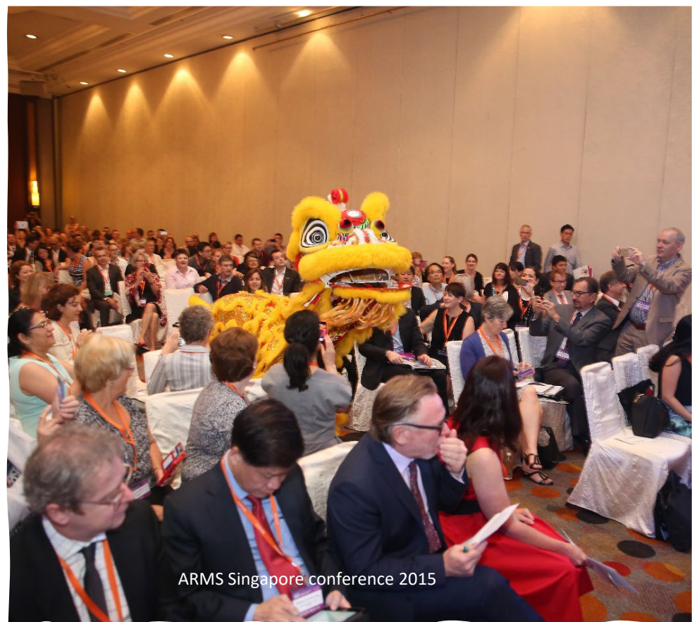
ARMS Singapore conference 2015